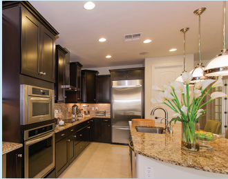
Remodel your home

Call 866-675-2432 to see how much you'll save when you Repower with Solar Universe. Your savings can enable you to: