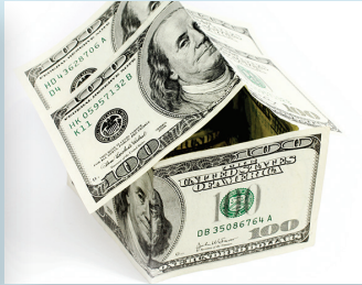
Shave years off your mortgage