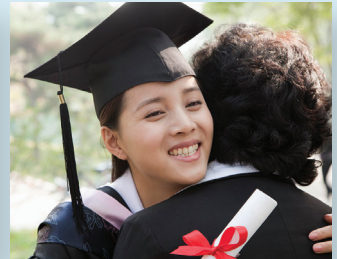
Send your kids to college

Call 866-675-2432 to Repower with SOLARUNIVERSE ™